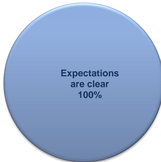
Figure 2. Respondent understanding of what is expected of them before the next meeting