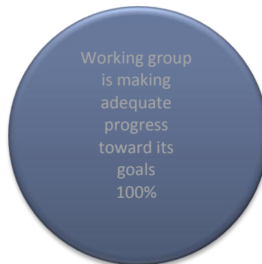
Figure 1. Respondent views of group progress