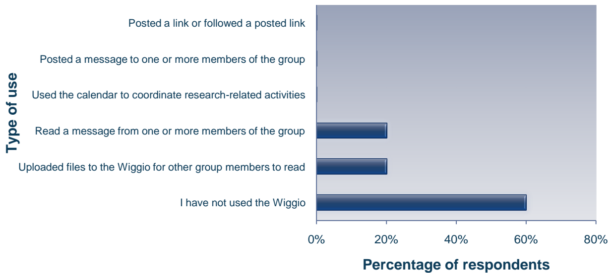
Figure 3. Wiggio use